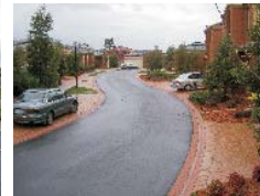
Typical unit development civil design