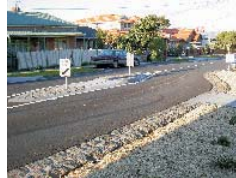
Typical road reconstruction with traffic management