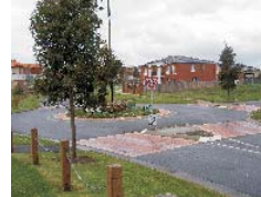
Typical road duplication