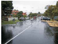
Typical road reconstruction